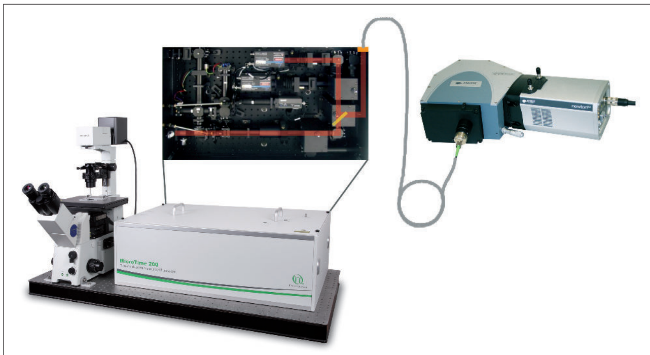
Fig. 1: Graphical presentation of the MicroTime 200 combined with a spectrograph. One example for the fluorescence beampath inside the main optical unit of the MicroTime 200 is shown in red. A beamsplitter (displayed in yellow) defines the part of the fluorescence that is directed towards the exit port (displayed in orange). The fluorescence is coupled into a multimode fiber and directed into the spectrograph SR-163 equipped with a Newton 970 EMCCD (Andor Technology).

The time-resolved confocal microscope MicroTime 200 is a powerful instrument for the investigation of fluorescent samples. It is built around an inverted microscope body and uses the method of Time-Correlated Single Photon Counting (TCSPC) for time-resolved