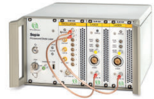
two channel version