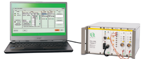
two channel version