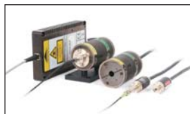
LDH-P/FA Series Picosecond pulsed laser diode heads

Available wavelengths: 375 - 510 nm, 530 nm, 595 nm and 635 - 1990 nm, options: peltier cooled, high power version, narrow spectral bandwidth, selected short pulses, fiber coupling to singlemode and multimode optical fibres