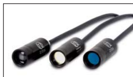
PLS Series Sub-nanosecond pulsed LEDs

Available wavelengths: 375 - 510 nm, 530 nm, 595 nm and 635 - 1990 nm, options: peltier cooled, high power version, narrow spectral bandwidth, selected short pulses, fiber coupling to singlemode and multimode optical fibres